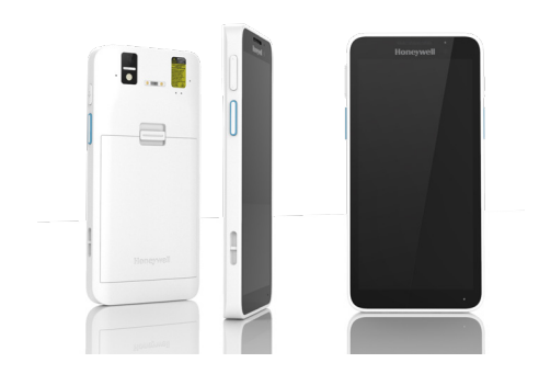
Fig 3: CT30 XP with Healthcare Housing