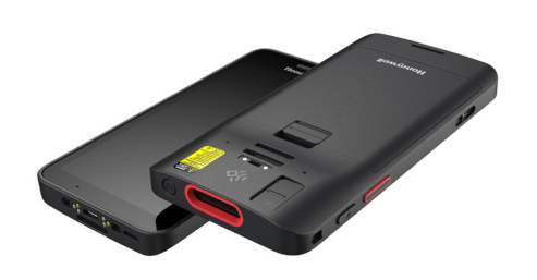
Fig. 1: CT30 XP: An all-purpose, universal power tool in consumer form factor with

Users will appreciate the design of the CT30 XP, which packs a vivid, 5.5-inch (14 cm), full-high-definition (FHD) screen into a slim, lightweight, yet durable package. Gentle curves meet the aesthetic demands of customer-facing, top tier retail and hospitality environments while making the device easy to hold and hard to drop.