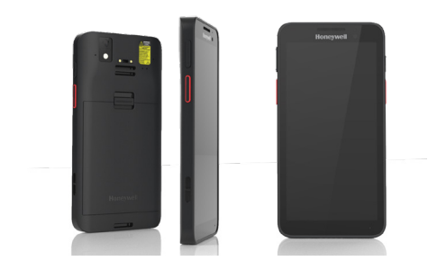
Fig 2: CT30 XP with Disinfectant-Ready Housing

The CT30 XP comes with a complete set of accessories, including Universal Dock chargers which can be field upgraded by the end user without tools to support multiple Honeywell field mobility computers now and in the future. Other accessories include an easy-to-replace, warm swap battery, wearable accessory for hands free use, IH40 RFID handle for fast cycle counting, ruggedizing boot and low profile belt clip for healthcare.